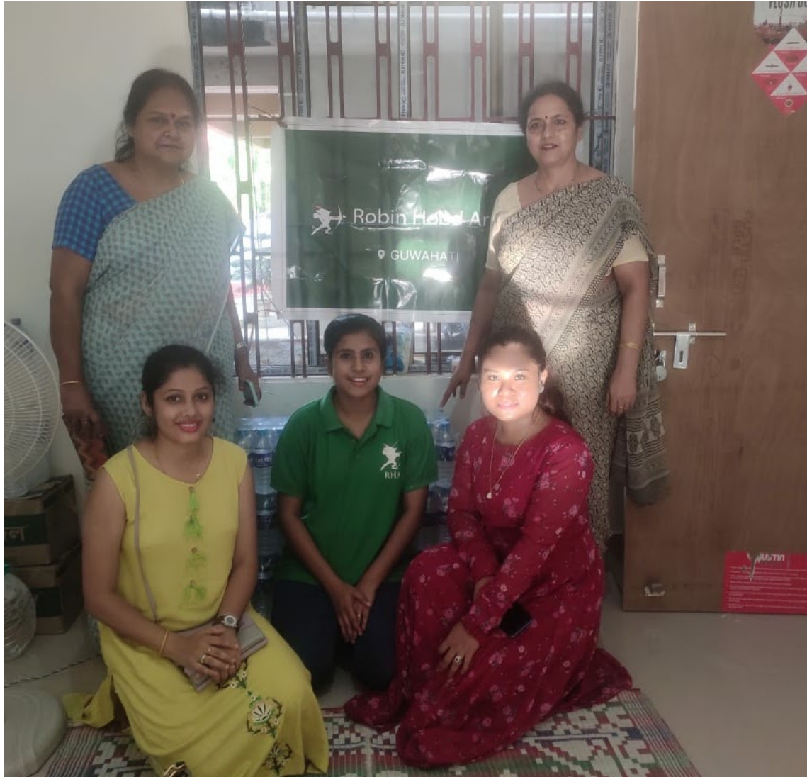
Figure 1 Volunteers of Robinhood Army received supplies from Bikali College staff