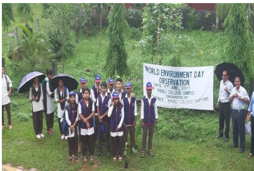
Fig 2: World Environmental Day Observance and Plantation Programme, 05.06.2019