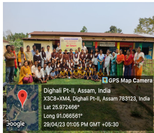
Fig 8: Climate Action and Awareness Programme