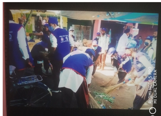
Fig 5: Cleanliness Awareness Program at Dhupdhara Daily Market, 28.11.2021