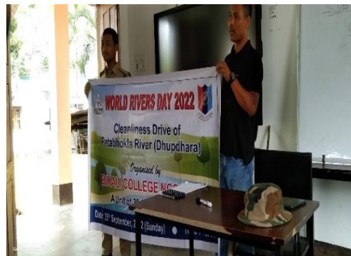
Fig 6: World River Day 2022 Clean-Up, 25.09.2022