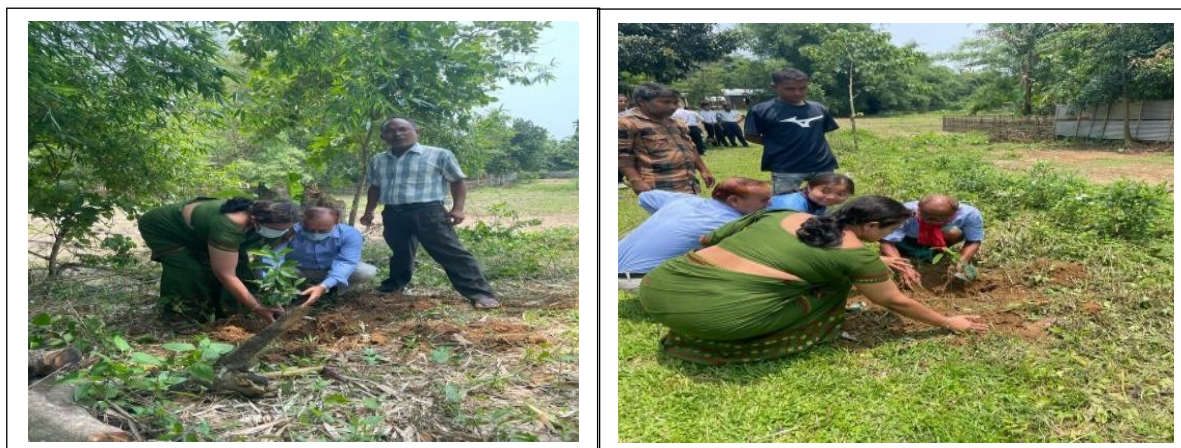
Fig 1: Plantation Drive on World Nature Conservation Day, 28.07.2018