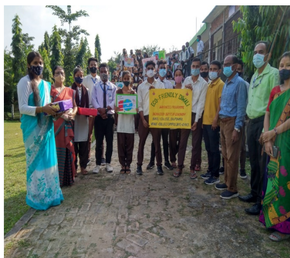
Fig 7: Green Diwali Initiative: Promoting Eco-Friendly Celebrations, 22.10.2022