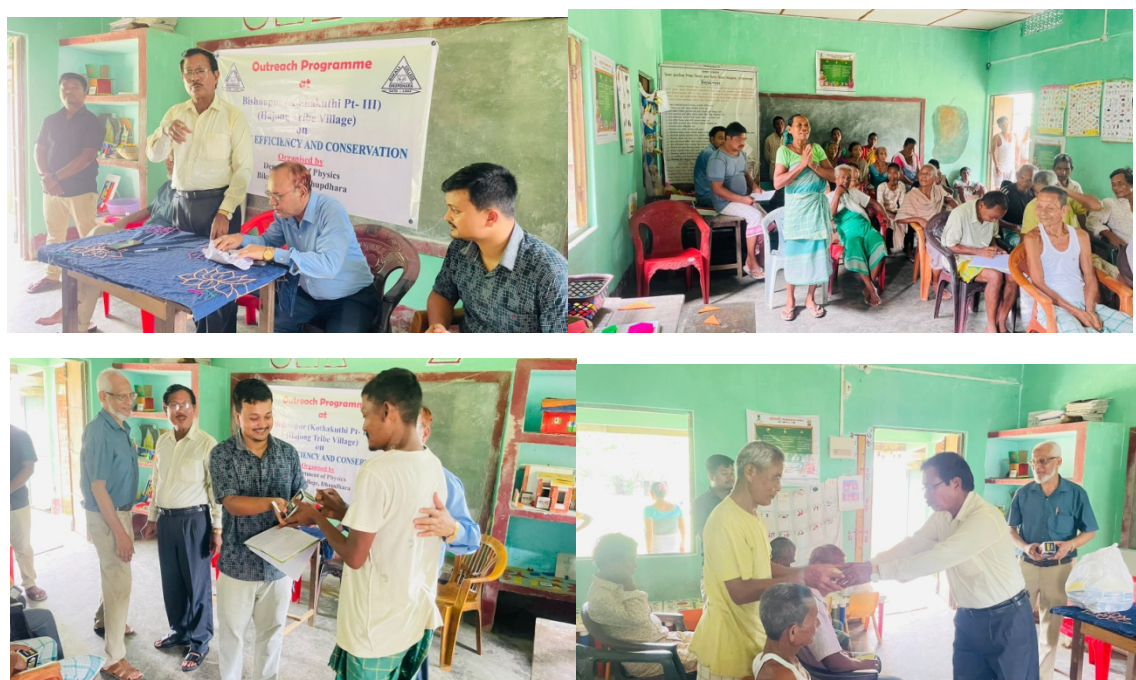
Fig 3: Programme on Energy Efficiency and Conservation, 15.05.2019