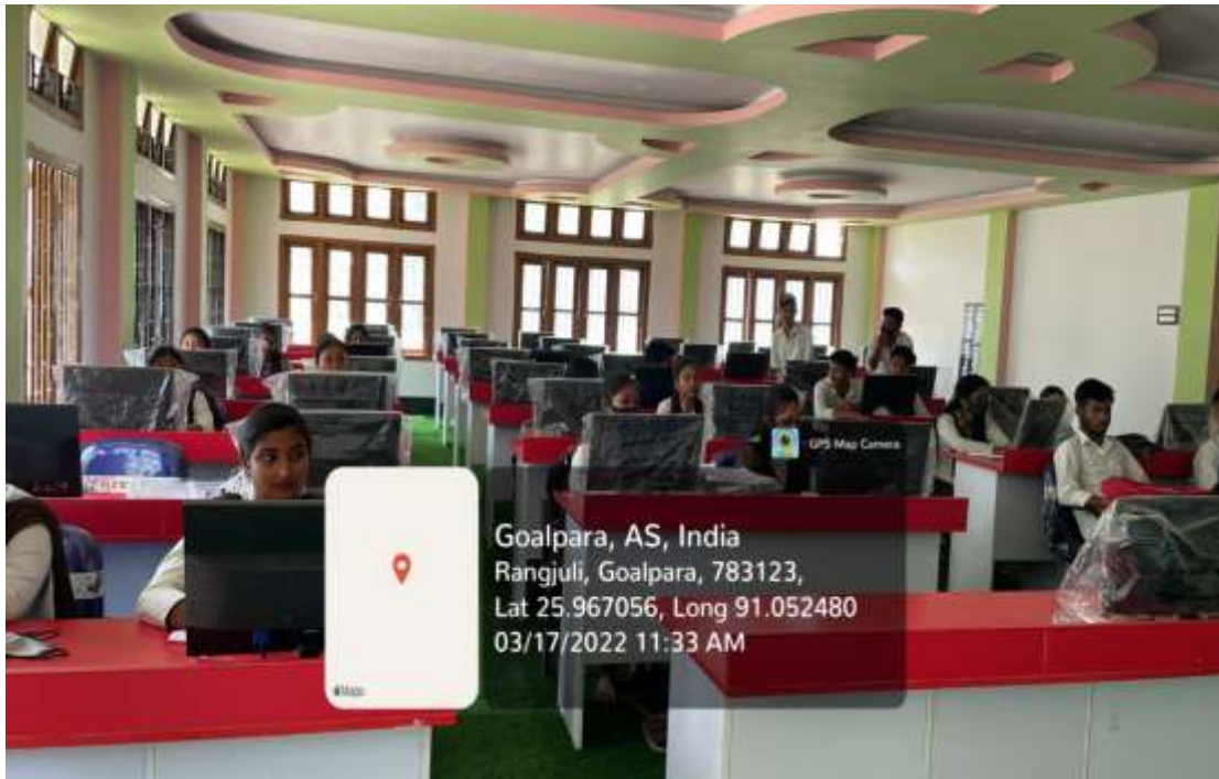
Figure 7: Computer lab 1