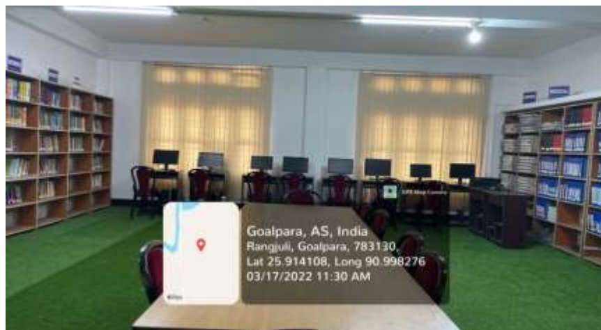
Figure 5 Digital Library