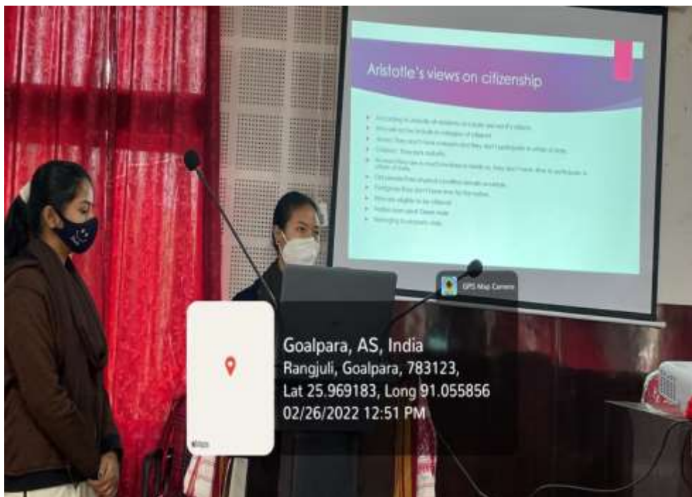
Figure 6: PPT presentations by students of assignments