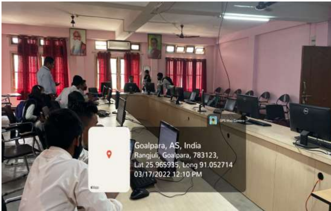
Figure 8 Computer lab 2