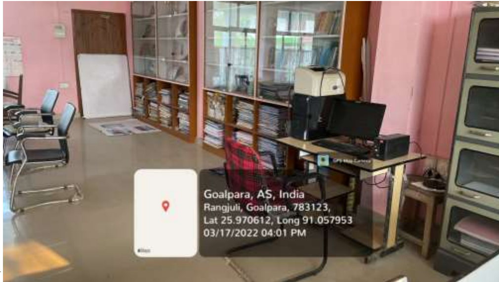
Figure 2 : Desktops in Department of Geography for use by teachers and students